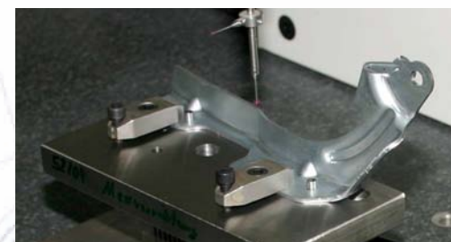
Coordinate measuring device